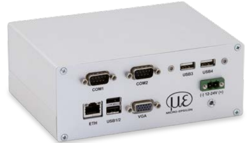
thermoIMAGER TIM NetPC