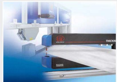
Measurement and inspection systems