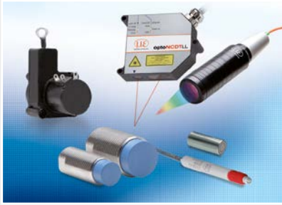
Sensors and systems for displacement and position