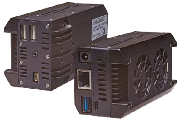
thermoIMAGER TIM NetBox