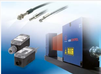
Optical micrometers, fiber optic sensors and fiber optics