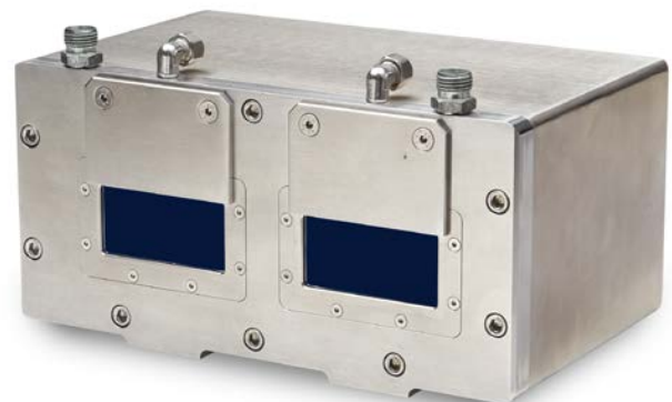
SGHx ILD size M (140x180x71mm) for optoNCDT 1750 / 2300 dimensions 150 x 80 mm