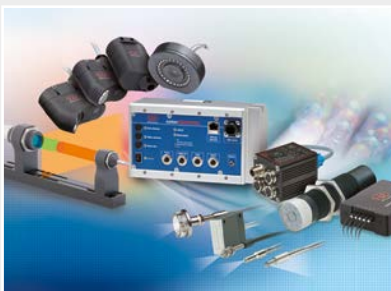
Color recognition sensors, LED analyzers and color inline spectrometer