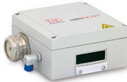
SGHx ILD size S (140x140x71mm) for optoNCDT 1750 / 2300 dimensions 97 x 75 mm

Minimum water flow rate Q(\min) = 3\text{ liters/min}