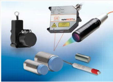
Sensors and systems for displacement and position