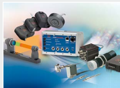
Colour recognition sensors, LED analyzers and colour online spectrometer