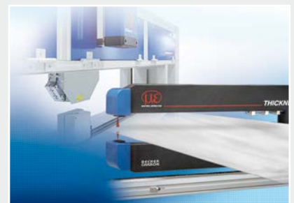
Measurement and inspection systems