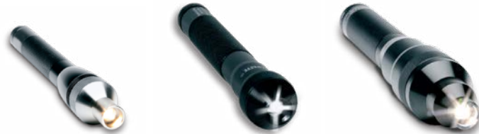
Mini Maglite hand light source