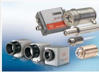
Sensors and measurement devices for non-contact temperature measurement