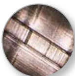
Signs of abrasion

incl. Mini Maglite, carrying case, 90° mirror tube, protective tube, 2x AA batteries and cleaning set