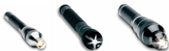
Mini Maglite hand light source