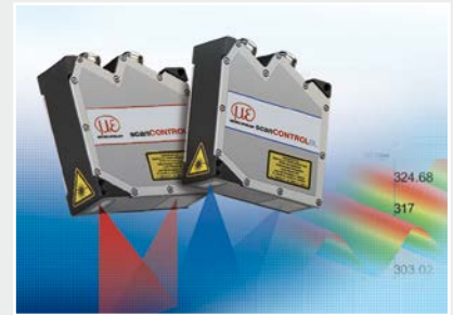
2D/3D profile sensors (laser scanner)