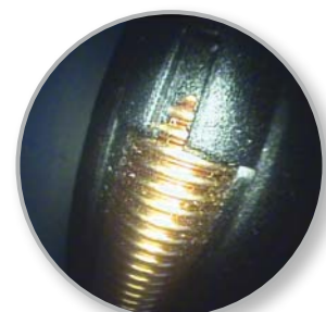
Installation position of spring