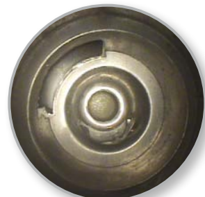
Checking brake cylinder for burrs