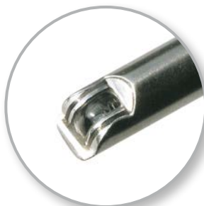
Swing-prism of the MKF-D

Now also available with 4.3 mm outer diameter