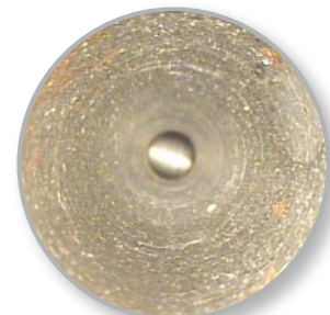
Deposits in pipe