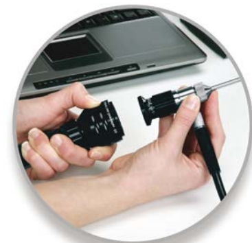
Attachment of camera and lens onto endoscope